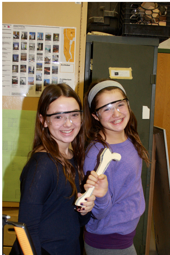
Showing off their bones.